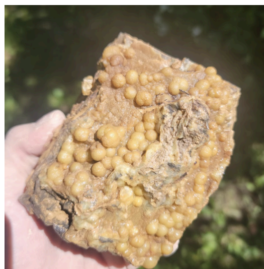
Wavellite on sandstone, Collected by R. Frost

Wavellite, a botryoidal mineral with a vitreous or greasy luster can come in a variety of colors and is often found in low grade metamorphic rocks high in aluminum. The chemical formula of wavellite is \text{Al}_3(\text{PO}_4)_2(\text{OH},\text{F})_3 \cdot 5\text{H}_2\text{O} . Wavellite forms due to hydrothermal events which are high in fluorine, aluminum and phosphorus. Most often wavellite from Arkansas or Pennsylvania is a green color and can sometimes be found with other associated minerals. At the Pennsylvania location the wavellite (pictured to the right) is found on sandstone and sometimes with quartz. Fossil gastropods, and brachiopods have also been found in the sandstone which researchers believe provided the phosphorus to create the wavellite. The location in Pennsylvania was found in 2005 by Bob Weaver from Lititz, PA. Bob Weaver was a notable collector and prospector from Pennsylvania. Bob moved out west and while spending time there became under question for